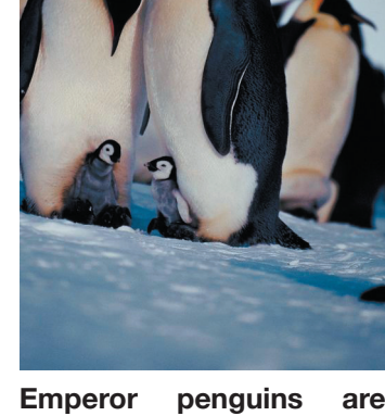
Emperor penguins are large penguins that live in the South Pole.

There are many different kinds of penguins. One that you might see at a zoo is called an emperor penguin. They come from the South Pole. They are the largest of the penguins and can grow to be 45 inches tall and weigh 90 pounds.