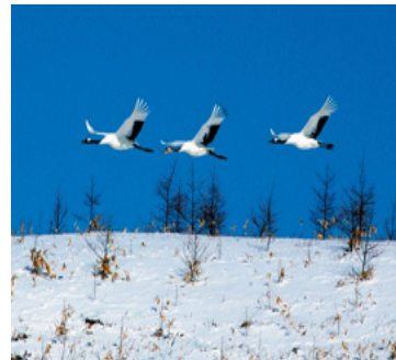
Birds have feathers.