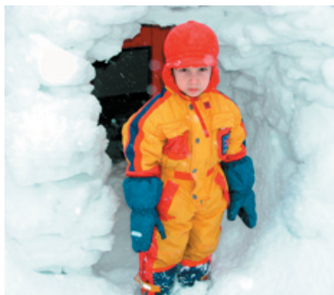
People wear jackets.