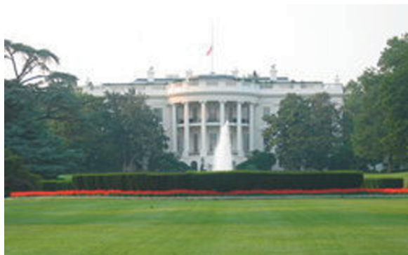
White House - south side