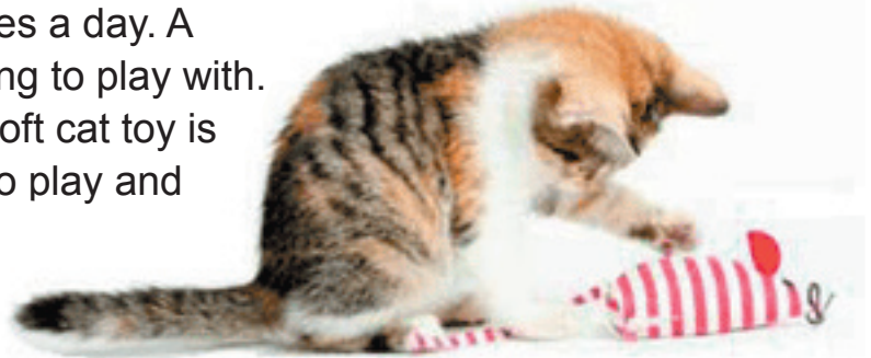
Kittens love to play!

A new kitten brings a special kind of joy to your home. If you get a new pet kitten you must learn how to take good care of it. It needs a soft warm place to sleep. Sometimes you will hear it purr while it sleeps. You should feed it special food made for kittens three times a day. A kitten also needs something to play with. A ball of yarn or another soft cat toy is always fun. Kittens love to play and sleep a lot!