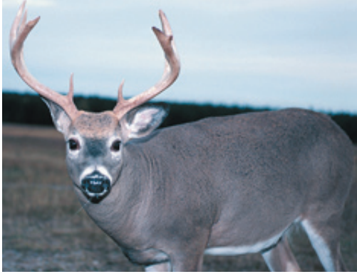
Male deer have antlers.

Deer can be found in the woods. The male deer is bigger than the female deer. The female deer takes care of the babies. She looks for food for them. She shows them how to live in the woods. Male deer have antlers that look like tree branches.