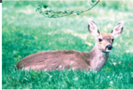
Female deer care for their babies.

Deer can be found in the woods. The male deer is bigger than the female deer. The female deer takes care of the babies. She looks for food for them. She shows them how to live in the woods. Male deer have antlers that look like tree branches.